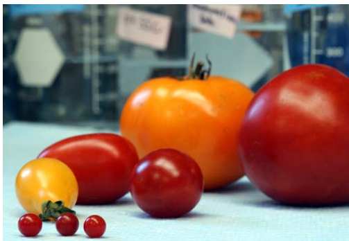
Figure 1. Tomato is the most popular home grown vegetable in the United States! Tomatoes come in many sizes and colors.