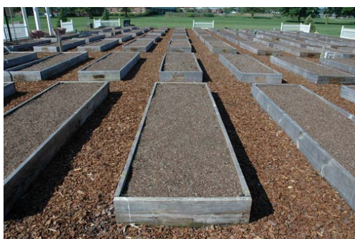
Figure 3. Raised beds are a great way to grow tomatoes and other garden vegetables.

The soil test reveals the soil pH, buffer pH (also called lime index), and nutrient levels. If the soil pH is not in the right range, lime can be added to raise soil pH while elemental sulfur (also called soil sulfur) can be added to lower soil pH. Soil pH modification can take up to 3 to 6 months. Hence, it is a good idea to have the soil tested a year before tomato plants are planted. However, any time is a good time to have the soil tested as long as soil is not frozen or too wet, if you have never done so. Many home gardeners wait until there is a problem before testing the soil. A soil test prior to planting gives you a baseline for better understanding your soil needs. Proper fertilization will not only ensure optimum production but also avoid unnecessary addition of minerals to the soils. Hence, soil testing can save you money and help protect the environment!