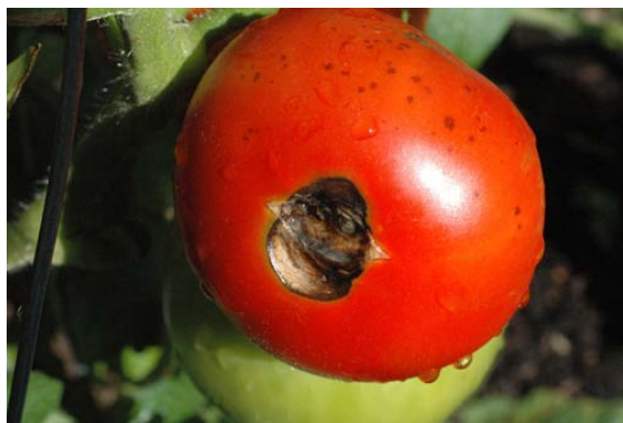
Figure 10. Blossom-end rot is a common problem of early tomatoes. It is not caused by infectious disease, but a calcium deficiency.

Blossom-end rot is characterized as a dry, sunken, black spot or area on the blossom end of the fruit (Figure 10). This problem is not caused by an infectious disease, but rather an insufficient supply of calcium in the fruit due to cold soil, pH imbalance, water stress, excessive nitrogen, and possibly limited availability of calcium in soil. Blossom-end rot is more common on early tomatoes. Mulching, more frequent watering, correction of soil pH imbalance, liming, pruning, and calcium sprays might help. Refer to OSU Extension fact sheet HYG-3117, "Blossom-End Rot of Tomato, Pepper, and Eggplant" for more information.