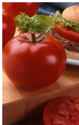
Figure 5. Disease resistance, fruit size and quality, ripening season, and growth habit are some of the common characteristics when selecting tomato cultivars to grow. Shown here is the 1994 All America Selection Winner ‘Big Beef’ cultivar.

A few tomato cultivars are listed in this fact sheet, however, it is not realistic to list all of the tomato cultivars available. You can also find many websites that list tomato cultivars. Talk to Extension professionals, Master Gardener volunteers, the employees at local garden centers, other local gardeners, friends, and relatives, to find out what other cultivars do well in your area. Another good source is All-America Selections (AAS). The website is all-americaelections.org . AAS conducts national trials of flower and vegetable cultivars and AAS winners are reliable cultivars. Gardeners can also experiment by trying one or two new cultivars each year. Refer to Tables 1-3 for a list of suggested tomato cultivars.