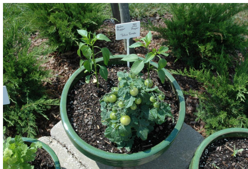
Figure 9. Some tomato cultivars are very compact and can be grown in containers.

Tomato plants need about 1 to 1½ inches of water per week. Water plants in the morning for the best success. Watering plants in the evening keeps roots and leaves wet longer, thus encouraging the development of diseases. There is no need to water the leaves; only plant roots need to be watered. Soaker hoses or drip irrigation are great ways to deliver water directly to plant roots. Watering cans or hoses also work too. If possible, avoid using an overhead sprinkler since leaves will remain wet for longer periods of time, increasing the potential for disease.