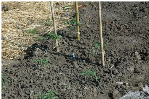
Figure 6a. Staking is a good way to support tomato plants if gardeners desire fewer, but bigger tomatoes. Shown here are staked young tomato plants using bamboo poles.