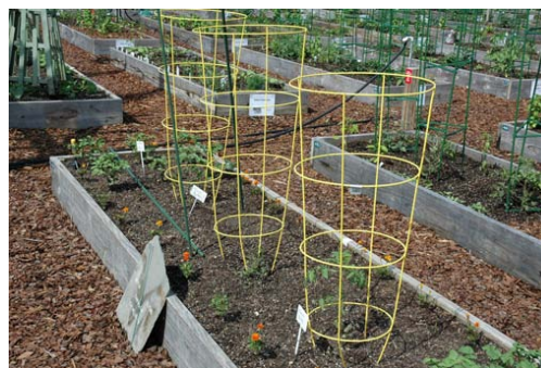
Figure 8. Caging is also a very popular way to support tomato plants. Caged tomato plants tend to be more productive, but fruits might ripen later due to heavier fruit load.