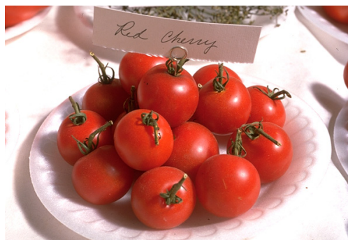
Figure 2. Tomatoes are often eaten raw as a garnish for salads and appetizers.