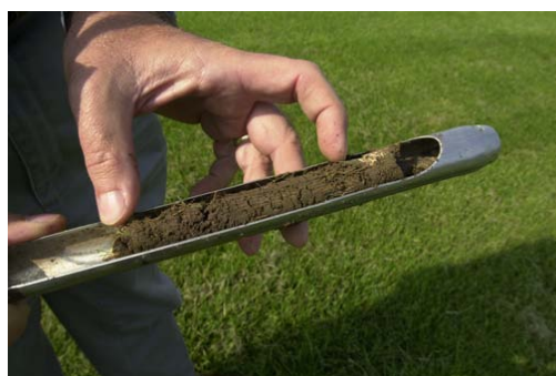
Figure 4. Soil testing is an excellent way to determine what your soil needs for the best tomato production.