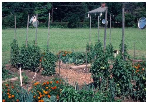
Figure 6b. Staked tomato plants in summer in a vegetable garden.

There are several variations of staking tomato plants. Two-inch oak stakes can be used for each plant with tomatoes “tied” to the stake. A section of cattle panel fencing can be used as physical support.